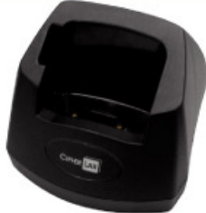
Charging & Communication Cradle